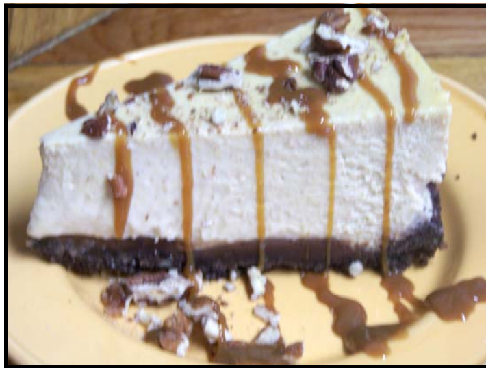
Fresh Baked Cheese Cake