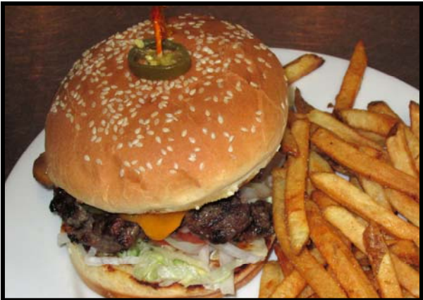
4 Alarm Chili Burger

The classic topped with melted cheddar. Comes with lettuce, onion and mayo. 8