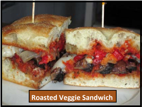
Roasted Veggie Sandwich

Slow roasted Black Angus beef & melted white cheddar on a philly roll. Served w/ Au Jus. 9