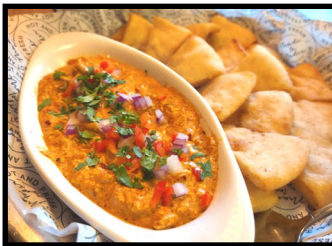
Southwest Chicken Dip